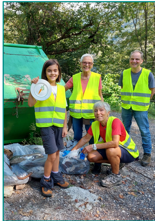
A Plogging Challenge we set up for and with the @Canton Ticino