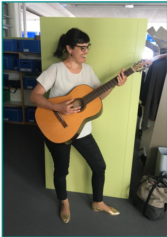
Sharing Economy Pop-Up store @WWF Switzerland