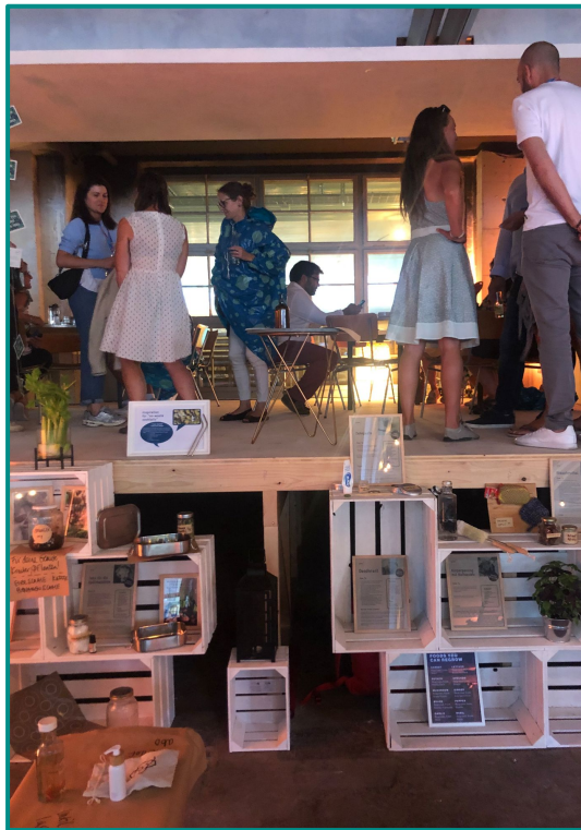
Zero Waste workshops and inspiration wall for a large employee event @Allianz